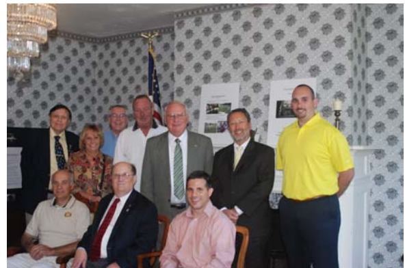
Cohoes Rotarians and guests at the Van Schaick Mansion