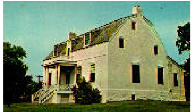
Van Schaick Mansion