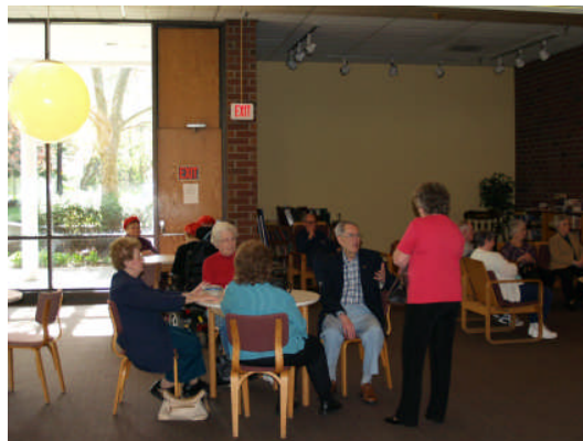
Waiting to Get In!