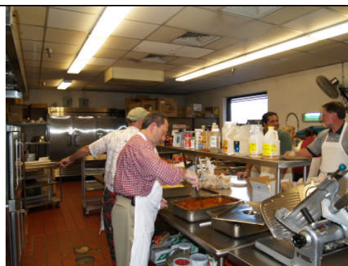
The Kitchen Crew