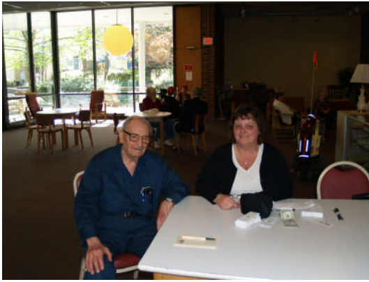
The Door - Ticket Sales